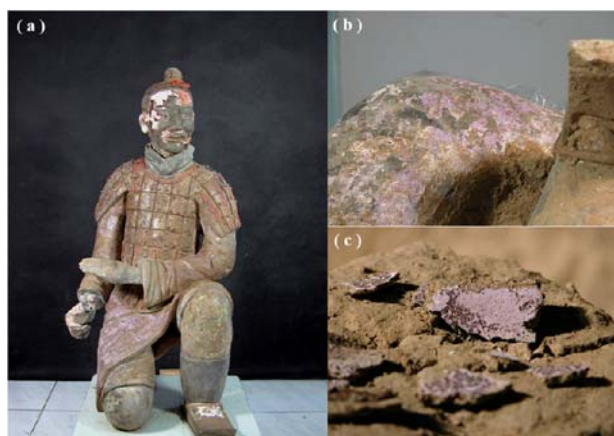
Figure 1: (a) Warrior # T18G21-08, a kneeling archer. The pigment samples in this study have been taken from this terracotta warrior. (b) Close-up picture of the purple paint on the terracotta warrior. (c) Images of the purple paint samples used in this study.

In March 1974 during the sinking of wells for farmland irrigation near Xi'an, China, 9 farmers made one of the world's most remarkable archaeological finds: the discovery of an army consisting of more than 8000 life-size terra cotta figures of warriors and horses of the First Emperor of Qin. One of the most intriguing puzzles is the purple synthetic pigments ("Chinese Purple" or "Han Purple" [1]) found on the terra cotta soldiers (figure 1). Until the 19 th century, most pigments were based on naturally occurring colored minerals and dyes, with three significant exceptions: Egyptian Blue ( \text{CaCuSi}_2\text{O}_{10} ), Chinese Blue ( \text{BaCuSi}_2\text{O}_{10} )/ Purple ( \text{BaCuSi}_2\text{O}_6 ) and Maya Blue. The former two are alkaline-earth copper silicates, and because of this similarity it has been proposed that the Chinese pigments were derived from Egyptian Blue [2].